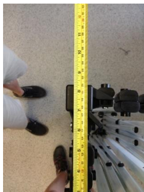
EZ up width