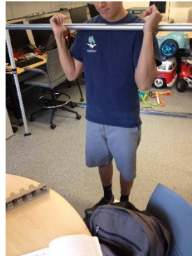
Middle bar & wheels (5.6lbs)