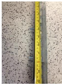
railing (just one section)