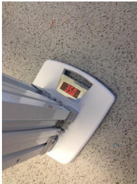
Easy Up (35.0lbs)