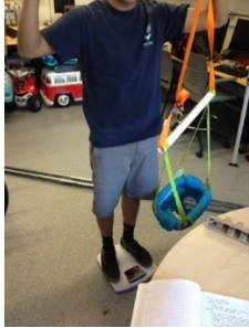
Swivel, harness, PVC, bearing, tow strap, bungee (0.6lbs)

A bathroom scale has been used to measure the weight of the device. A.J. was weighed on the scale (134.8lbs) before holding all the components and stepping on the scale. A.J.'s weight was subtracted from each to get the true weight.